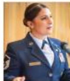
Heritage High AFJROTC teacher wins recognition

Have you or someone you know reached a "milestone"? If so, we'd like to know about it! Email your information to editor@freemountainpress.com .