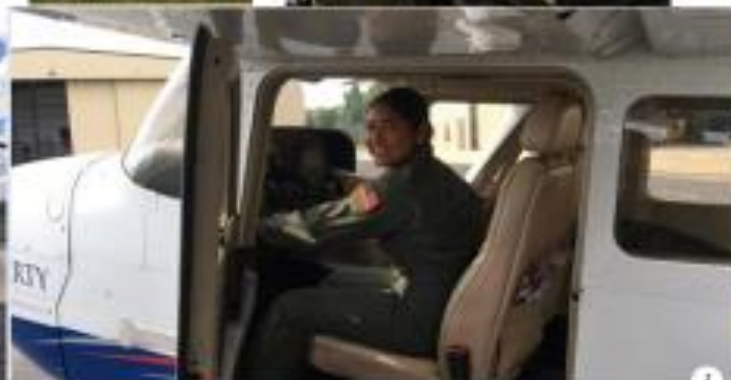
AFJROTC announces 2021 Flight Academy scholarship winners